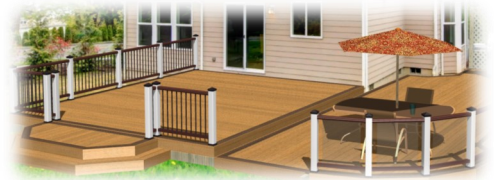
3D DECK+RAIL DESIGN